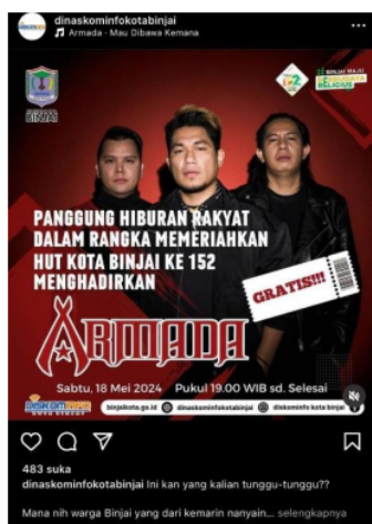
Figure 1. Social Media Activity Posts

Additionally, Diskominfo can actively utilize social media as a means to communicate directly with the public. They can disseminate the latest information, answer public questions, and respond to feedback or complaints through platforms such as Instagram.