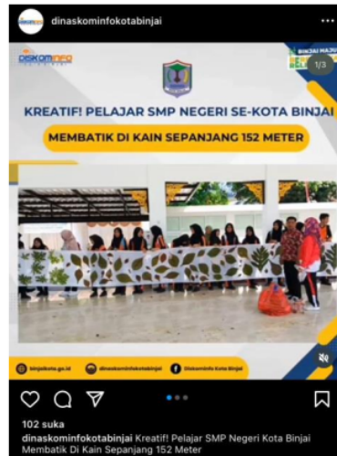
Figure 2. Public Activity Posts of Diskominfo Binjai City

Diskominfo can organize public events, seminars, or open discussions aimed at strengthening the relationship between the Binjai City government and its residents. Through these events, Diskominfo can provide opportunities for citizens to participate in the decision-making process and offer constructive feedback. Based on observations of the official Instagram account of Diskominfo Binjai, several points can be identified as PR strategies to enhance government image, including event announcements, hosting public events, interacting with users, and more. The research findings show that many public activities are oriented towards the openness of Diskominfo and the Binjai City government towards its citizens. This is evidenced by posts on the official Instagram account @dinaskominfokotabinjai, as shown below: